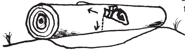
Bore in and then cut down

When cutting a log that is suspended at both ends (top bind), try carefully plunge-cutting into the side of the log about two-thirds to three-quarters of the way to the top. When the tip of the bar begins to show on the other side, you can then work your way down.